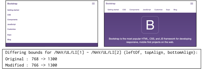
Figure 3: The original version of getbootstrap.com (top-left), the incrementally modified version (top-right), and a snippet of the report produced by REDECHECK (bottom).

To investigate the prevalence of the five common types of RLFs in real-world web pages and evaluate REDECHECK’s ability to detect them, we ran the tool on a corpus of 26 randomly collected web pages of varying complexity and domain. REDECHECK found RLFs of all five common types. Well over half of the web pages, including well-known ones such as Duolingo and Consumer Reports , contained RLFs [18]. Since these pages were all in production use and, we surmise, already subject to extensive testing, this result emphasises the importance and real-world relevance of the presented tool, further underscoring the benefits of using REDECHECK’s automated layout checkers. This empirical study also revealed that